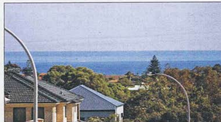
The property takes in views of the ocean.

Push back the cedar-frame sliders and you have a spacious entertaining